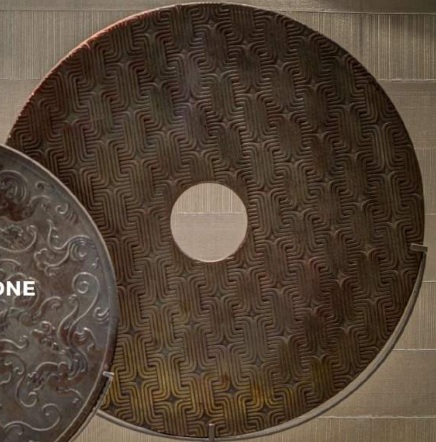
Circle of life in red metal € 225