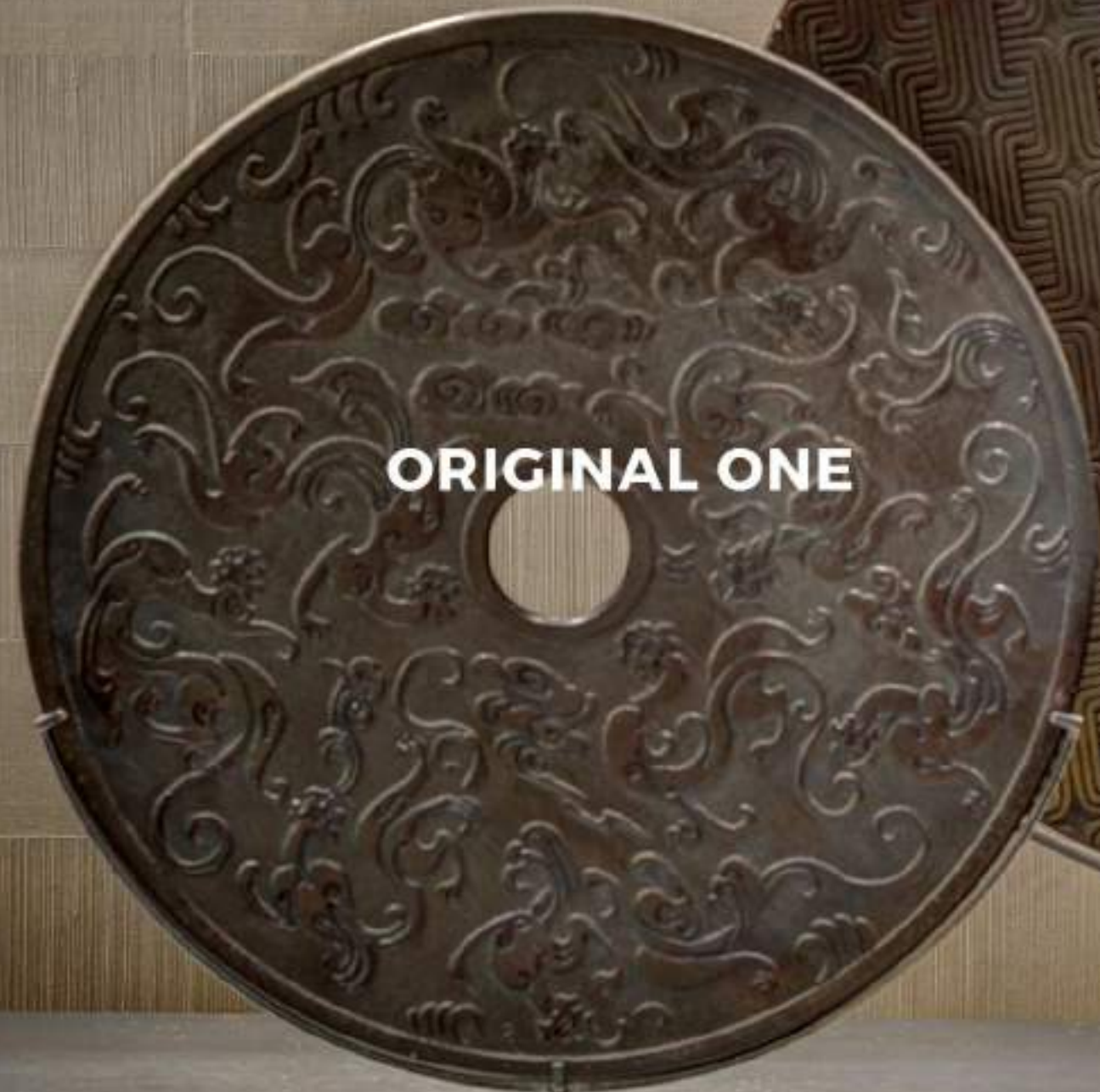
Circle of life in red metal € 125