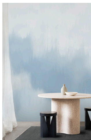
EH066SDC Daydream Blue