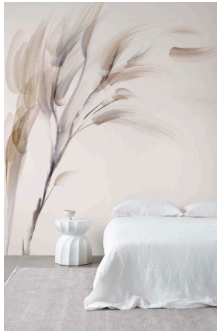
EH052WDC Dusky Rose