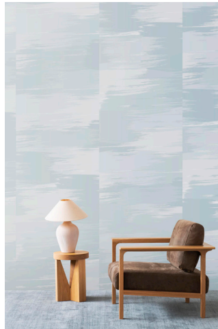
EH042MDCP Daydream Blue