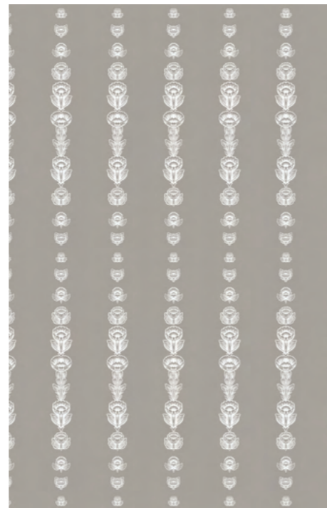
Coving Row White on Stone