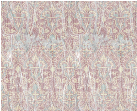
Painted Pugin Original