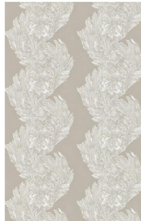
Stucco Stripe Viscose Linen