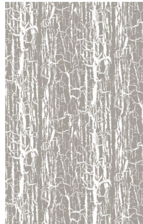
Cracked Up White on Stone