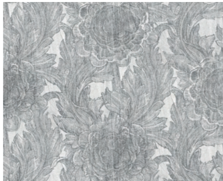
White Wash Rose Original