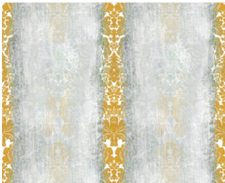
Emulsion Imagination Original

The Emulsion Imagination Wallpaper, Rip Swathe Wallpaper, Painted Pugin Wallpaper and Whitewash Rose Wallpaper were inspired by Timorous Beasties take on 'The Law of Ripolin', where sections of patterns peek through, creating a layering and depth to the designs.