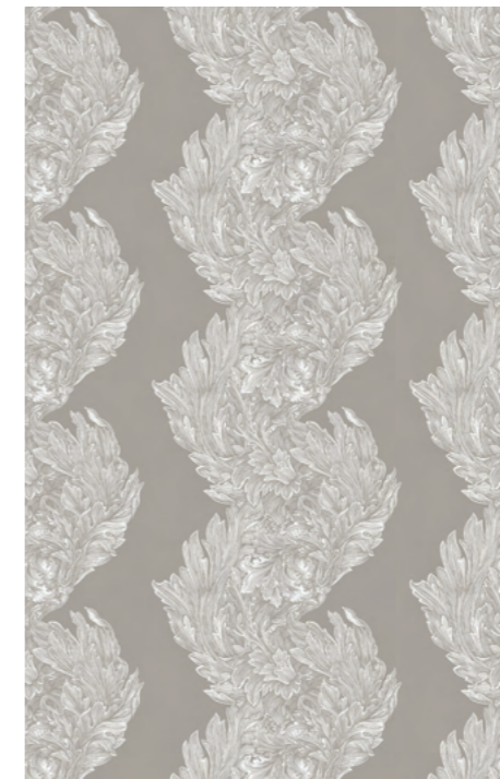
Stucco Stripe White on Stone