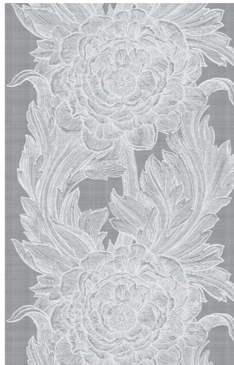
Tudor Rose Ivory

The Tudor Rose lace has been woven in Ayrshire, Scotland, in the only remaining patterned Nottingham Lace mill left in the UK. Tudor Rose has been designed on an unprecedented scale, rarely envisioned in lace fabric. When the fabric is drawn together, the design disappears into folds of the curtain, but when drawn open, the full dramatic scale of the pattern is revealed.