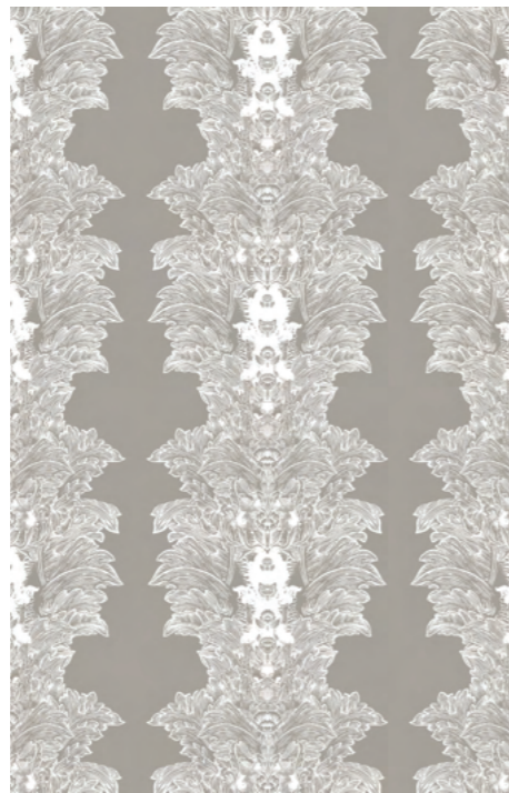
Cornice Crown White on Stone