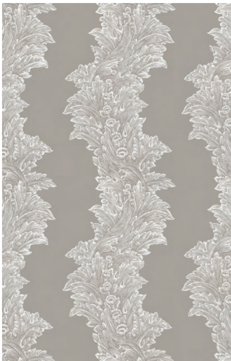
Acanthus Leaf White on Stone

Cracked Up Wallpaper echoes distressed plaster which is referenced throughout the collection. The split of the paint has been over exaggerated in scale to add a subtle drama to the design. Each wallpaper design has been handmade in Timorous Beasties studio in Glasgow.