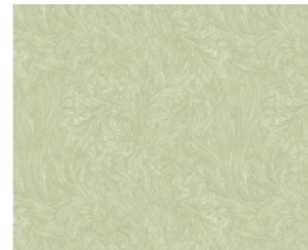
Stucco Crackle Savoye