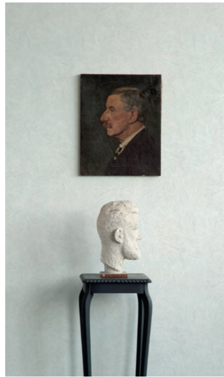
Stucco Crackle Ozenfant (White on Pearl)

The Stucco Crackle Savoye and Ozenfant wallpaper feature intricate, detailed and delicate illustrations and are available in either Ozenfant (White on Pearl), Savoye or Le Lac colourways.