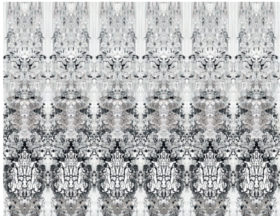
Ripolin Wallpaper Panel Original

The Ripolin Panel is an extravagant wallpaper and its unique layered design is an example of Timorous Beasties' pioneering use of digital printing technologies mixed with hand printing techniques, and is fully compostable.