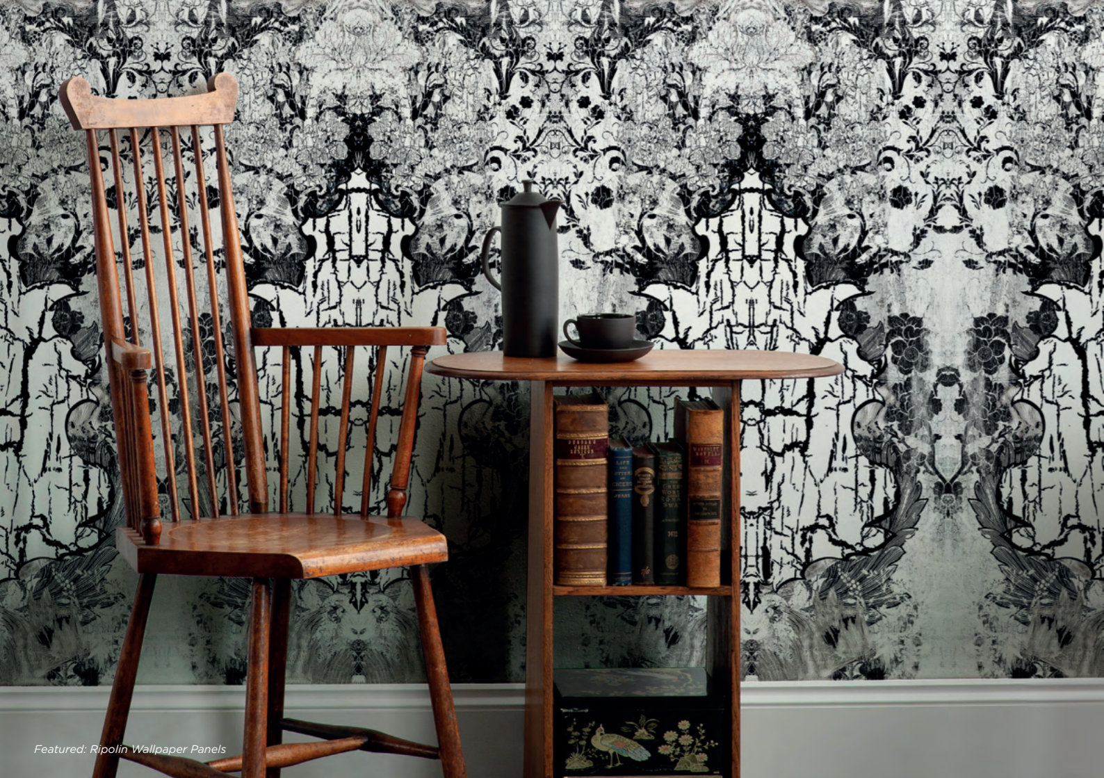
Featured: Ripolin Wallpaper Panels