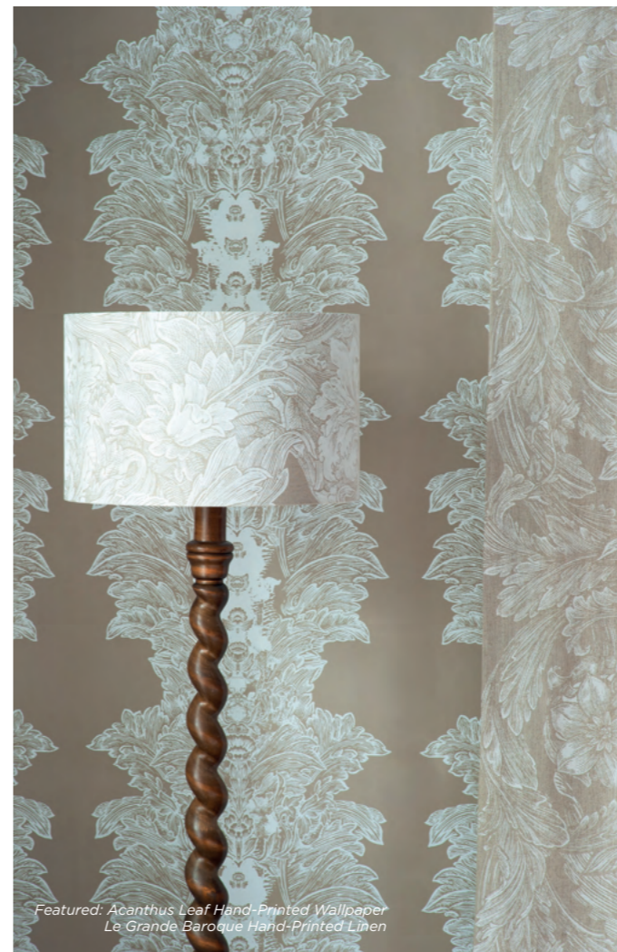
Featured: Acanthus Leaf Hand-Printed Wallpaper Le-Grande Baroque Hand-Printed Linen

Featured: Coving Row Hand-Printed Wallpaper