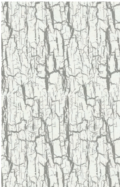
Paint Crackle Original

A new innovative addition to the Stucco collection, Paint Crackle and Stucco Allover woven fabrics capture the intricately hand-drawn baroque swirls and distressed paint textures beautifully within the textural jacquard.