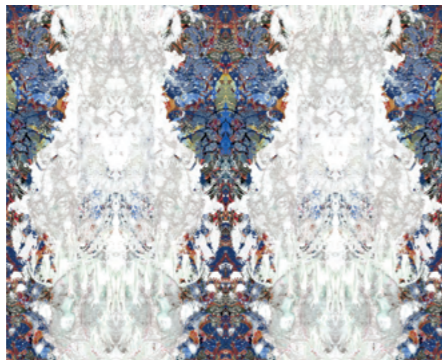
Rip Swathe Original