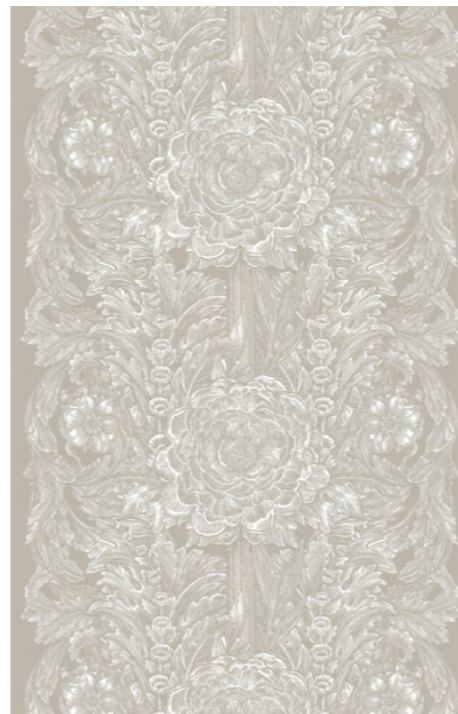
Le Grande Baroque Viscose Linen

Le Grande Baroque and Stucco Stripe are two intricately hand-printed linen fabrics presented within Stucco, incorporating exquisite repeat patterns of baroque swirls and florals. Subtle yet dramatic with the contrast of the bold and elaborate prints paring down with the simplicity of the opaque white and adding perfect balance to both elegant designs.